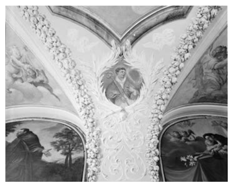
Fig. 2. Detail of the stucco decoration in the refectory of the Franciscan convent in Uherské Hradiště, Czech Republic