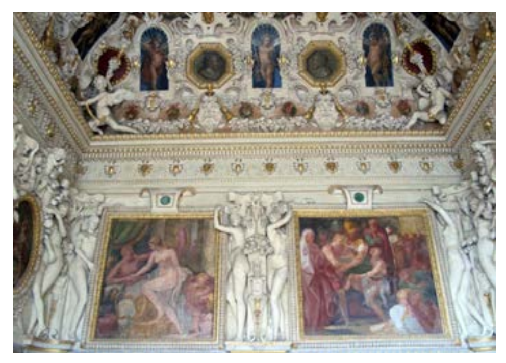
Fig. 4. Room of the Duchess d'Etampes, castle of Fontainebleau, France

integral representation of the human figure increasingly open to movement in space, as documented by the sculptures at the base of the vaults of the Doria loggia in Genoa and the room of Cupid and Psyche in the Tea Palace in Mantua (Fig. 3), is the preferential channel within which to re-read the arrival of female figures in the hall of the Duchess d'Étampes in Fontainebleau (Fig. 4)<sup>9</sup>.