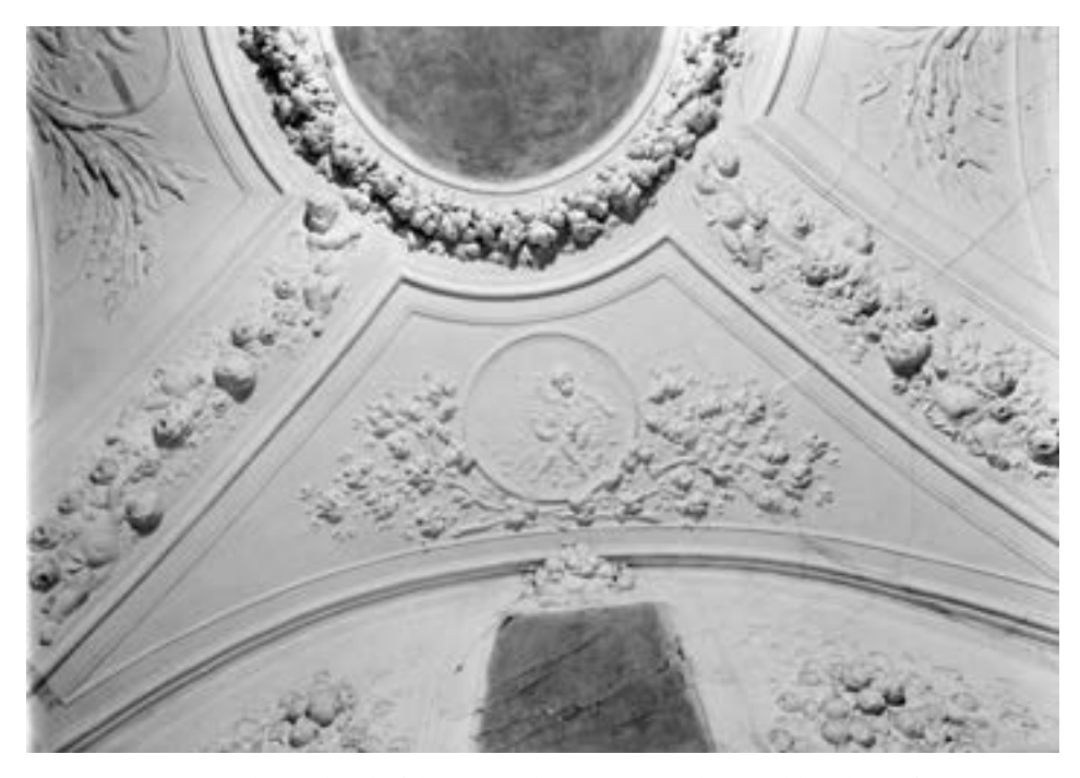
Fig. 11. Dom Hippolitów, detail of the stucco decoration, Kraków

Baldassarre in the so-called Dom Hippolitów in Krakow (Fig. 11)<sup>19</sup>, dated 1695-1704, showed, in fact, the contemporary use of the Baroque technique in the phytomorphic festoon initially created on easels and the technique of working on site.