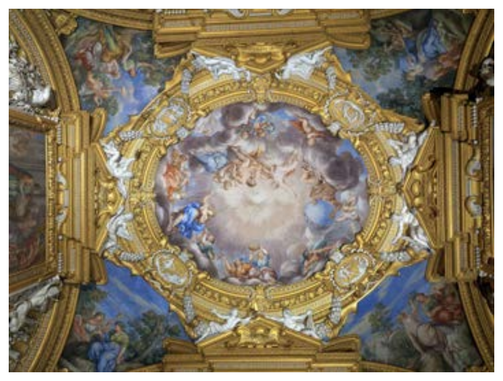
Fig. 7. Frescoes and stucco decorations in the hall of Apollo, Pitti palace, Florence (Pitti Palace Museum)

buildings. An example of this is also found outside Rome, in the Apollo room of the Pitti Palace in Florence (Fig. 7), where da Cortona, with Cosimo Silvestrini, began to work in the late 1640s<sup>12</sup>.