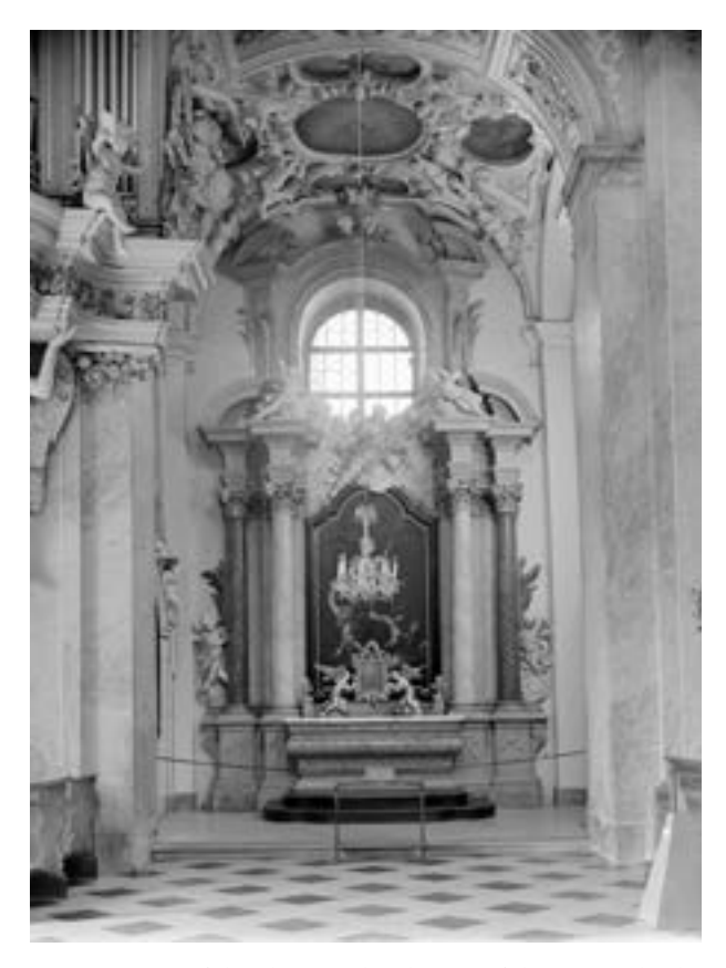
Fig. 13. One of the altars in the cloister of the Kopeček Abbey, Basilica of the Visitation of the Virgin Mary, Czech Republic

In the rooms commissioned by Karl II von Lichtenstein-Castelcorn, Prince Bishop of Olomouc, there is a phytomorphic descent suspended from a ribbon, a decorative typology practiced by Baldassarre, all performed on site, which was proposed for the first time with reduced thicknesses and therefore probably resolved only by nailing it according to a practice that was not yet present in Rome. These choices may have been determined by the educated client of the high prelate.