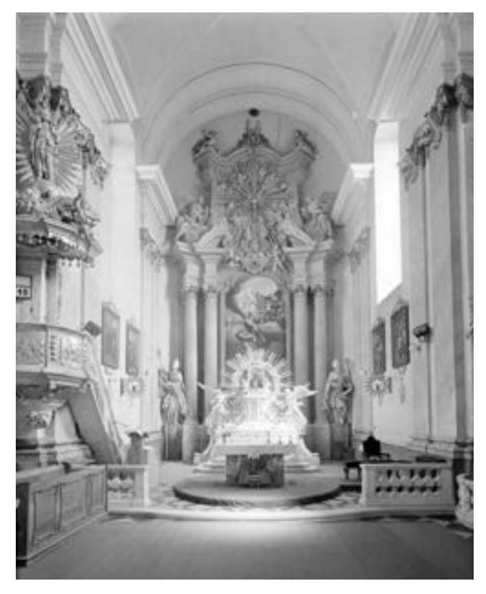
Fig. 14. Main altar in the parish church of Polešovice, Czech Republic

from around 1708, the most advanced point of Baldassarre's research towards the Rococo plastic graphics.