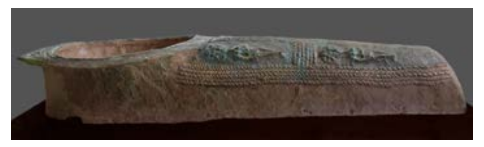
Fig. 13: Coffin from Nippur (YBC 2259), Yale Babylonian Collection, Yale Peabody Museum

Babylonian Collection in New Haven the sexual characteristics and in particular the breast are emphasized and are easily recognizable<sup>27</sup>. For this reason the female figure on the sarcophagus of Nippur YBC 2259 has been identified with Inanna Sumerian goddess who "represents the fruitful character of the earth" and in the syncretism of