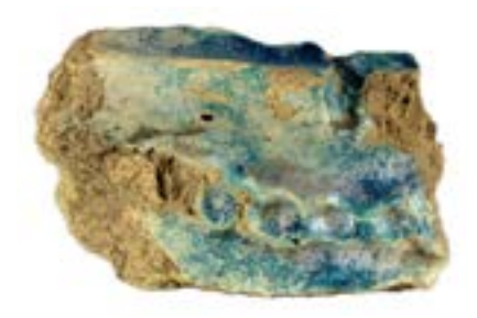
Fig. 4: Fragment of "bathtub" coffin rim, Inv. N. 57959 B, Museo Archeologico Nazionale di Firenze