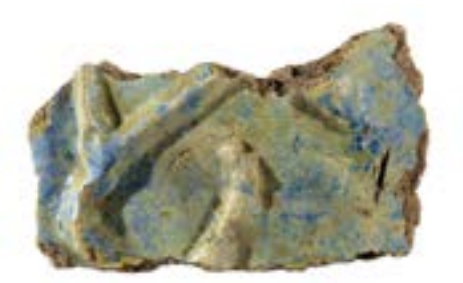
Fig. 10: Coffin wall fragment Inv. N. 57959 H, Museo Archeologico Nazionale di Firenze