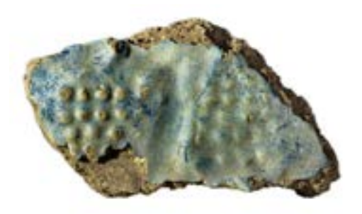
Fig. 9: Coffin wall fragment, Inv. N. 57959 G, Museo Archeologico Nazionale di Firenze