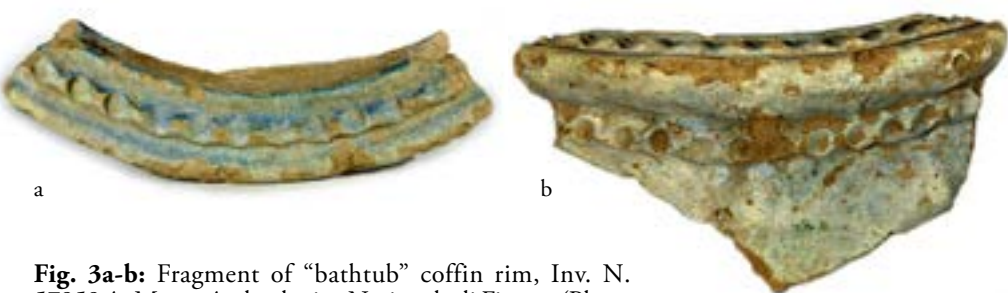
57959 A, Museo Archeologico Nazionale di Firenze