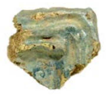
Fig. 7: Rim fragment of "bathtub" coffin lid, Inv. N. 57959 E, Museo Archeologico Nazionale di Firenze