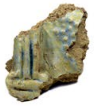
Fig. 8: Coffin wall fragment, Inv. 57959 F, Museo Archeologico Nazionale di Firenze

The decoration consists of applied curvilinear bands that can be interpreted as racemes, which, however, lack clusters and leaves.