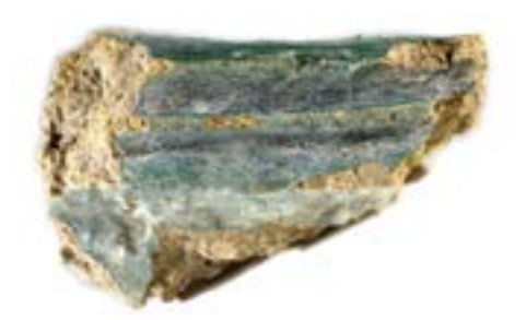
Fig. 6: Rim fragment of "bathtub" coffin lid, Inv. N. 57959 D, Museo Archeologico Nazionale di Firenze