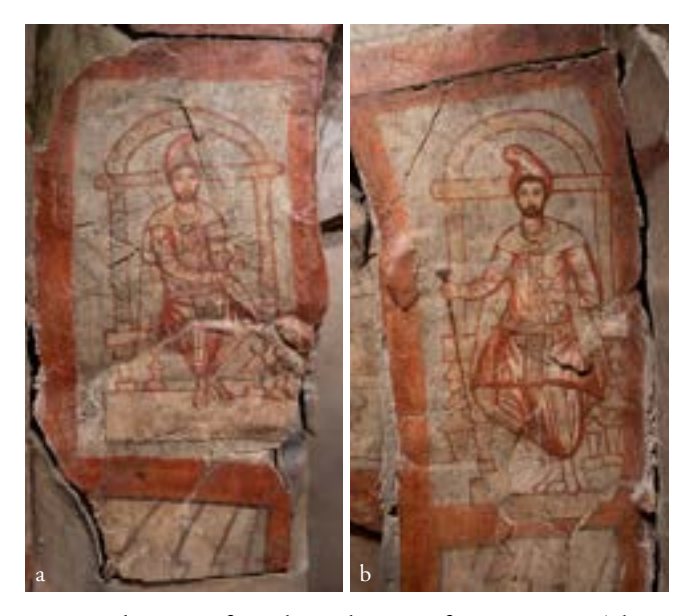
Fig. 12 a-b: Figures from the mithraeum of Dura Europos