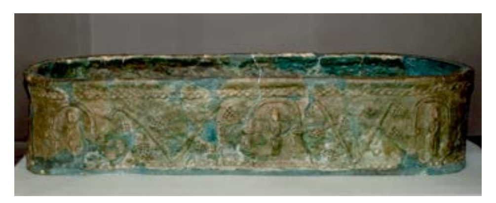
Fig. 2: Glazed Coffin preserved in Florence (Inv. n. 93805, Museo Archeologico Nazionale di Firenze; photo courtesy Museo Archeologico Nazionale di Firenze)